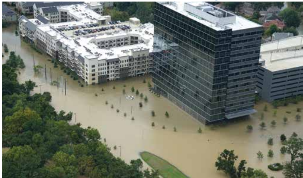
Figure 1. Flooding caused by Hurricane Harvey's massive, persistent rain resulted in $125 billion in damages and 65 deaths across the Houston region and Southeast Texas in 2017.

Before August 2017, Houston might have been best-known for the National Aeronautics and Space Administration's landing a man on the moon, or hosting the largest livestock exhibition and rodeo in the world. After August 25, 2017, the city also became an exhibit for urban flooding in the devastating aftermath of