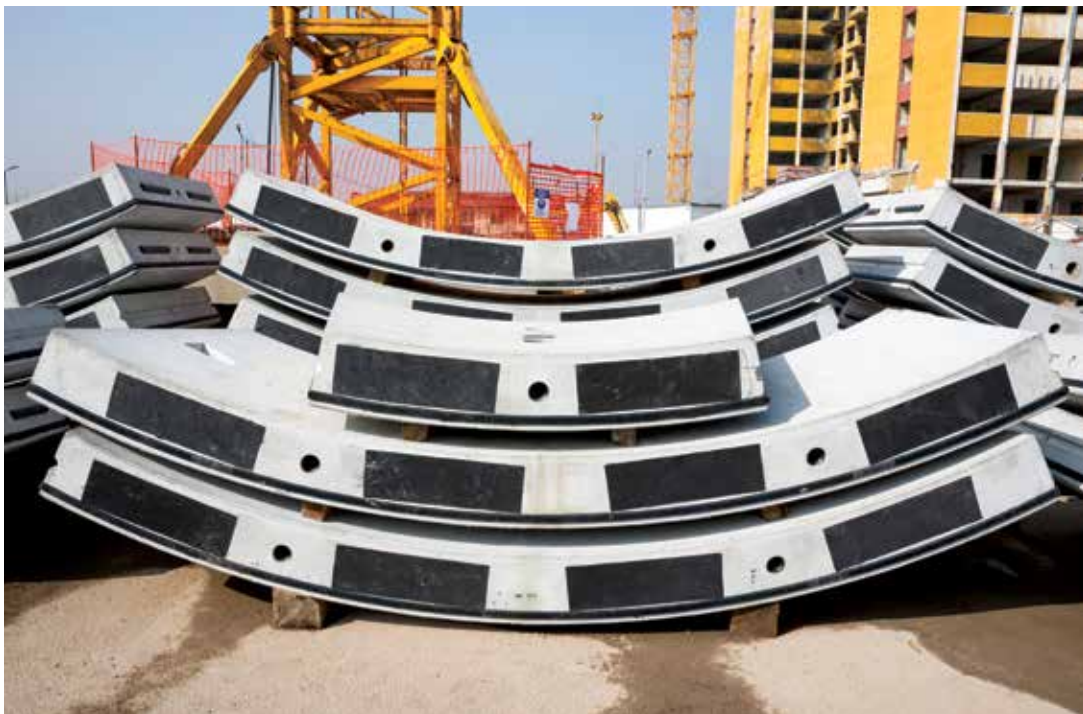
Figure 3. Structural design of concrete segments used for tunnels continues to improve, making the segments more durable and corrosion-resistant.

Excavation equipment must use pressurized-face tunneling equipment to control the earth and groundwater pressure that continually acts on the tunnel