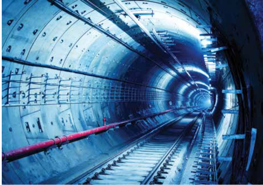
Figure 4. Tunnels are the skyscrapers of the underground, facilitating needed higher-density infrastructure development in urban areas and presenting unique engineering challenges the same way the first skyscrapers did in the 20 th century.

The first tunnel solely using synthetic fiber-reinforced segments is currently under construction near Kansas City, Missouri. These advances in segment reinforcement technology provide greater durability, longer service life, and an improved final product at a comparable or lower cost than the traditional methods.